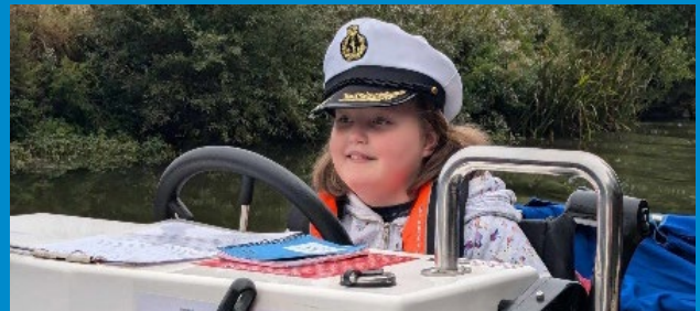
And a little bit older, a 10-year-old. Eyes glued to the bow!

We are so very fortunate to have so many brilliant volunteers – lovers of the river and boating who are keen to share their love of the river to others, perhaps less fortunate than themselves. Amongst them, in increasing numbers, are our Skippers, highly trained guys